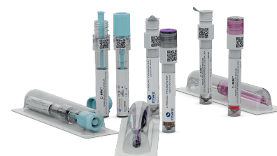
SampleSUITE™ + U-SWAB™ Liquid Transport