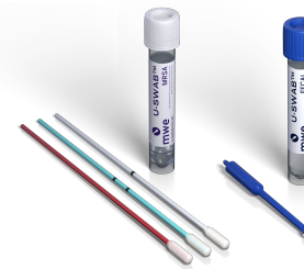
U-SWAB™ Liquid Transport